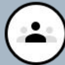
PowerSchool & Schoology